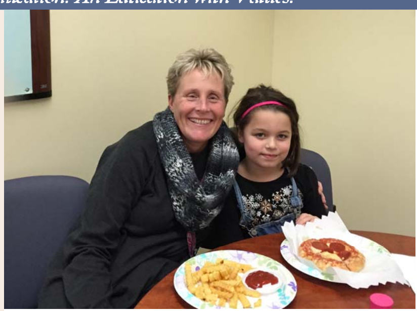
Time-In Reward at Stormonth Elementary School