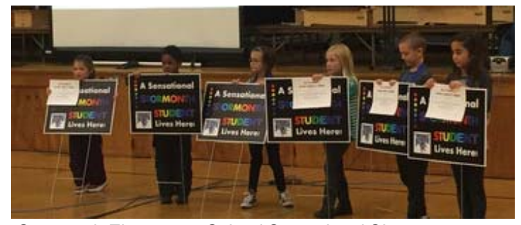
Stormonth Elementary School Sensational Six

Enhance communications from the school district to all community constituencies for the purpose of encouraging open and constructive discussions.