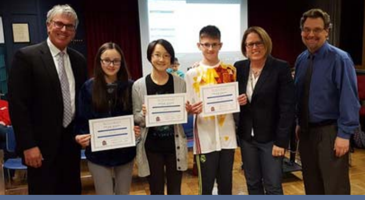
Bayside Robotics Winners receiving the Fox Point-Bayside District Pride Award

3/18: FPBS Educational Foundation "Rolling on the River" Fundraiser, Shully's Watermark